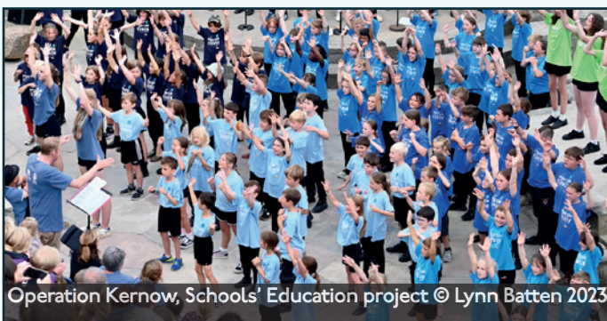
Operation Kernow, Schools' Education project