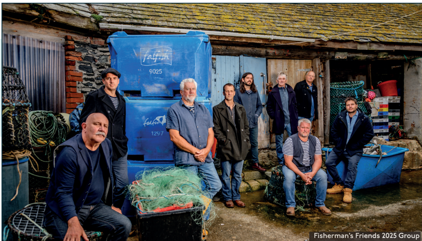
Fisherman's Friends 2025 Group