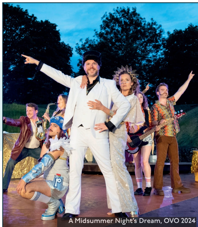
A Midsummer Night's Dream, OVO 2024