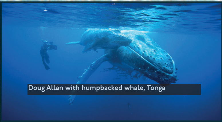
Doug Allan with humpbacked whale, Tonga

An eclectic mix of music from classical, pop, musical theatre and Cornish tunes with the traditional Proms finale.