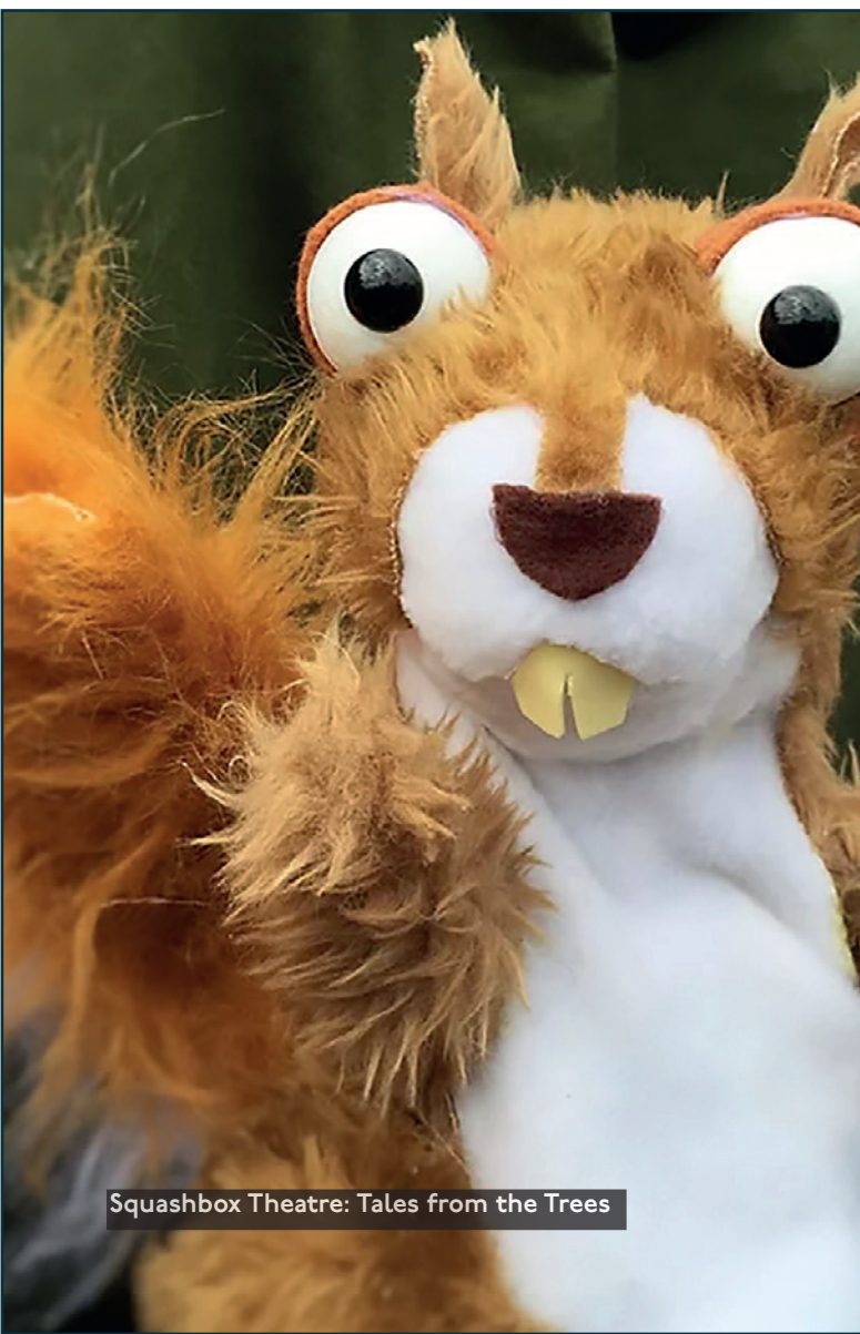
Squashbox Theatre: Tales from the Trees

Porthleven Town Band, Third Section Champions of Great Britain 2023, take us on a musical journey 'Around the World in 80 Minutes', traversing the globe from our corner of Cornwall.