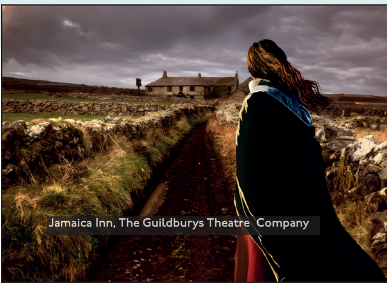
Jamaica Inn, The Guildburys Theatre Company

Ishmael Ensemble's music straddles the worlds of electronica and jazz. Comprising a shifting cast of collaborators, the Bristol collective explore vast sonic terrain with a unique honesty, intimacy and emotional heft.