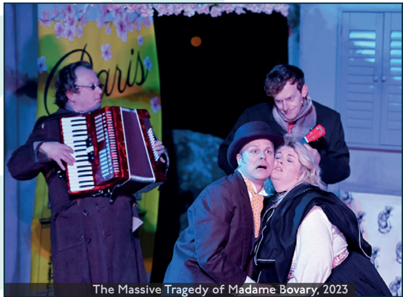
The Massive Tragedy of Madame Bovary, 2023

The magical musical by Tim Rice and Andrew Lloyd Webber, which tells the biblical story of Joseph, his father Jacob and his 11 brothers...and of course the coat of many colours.