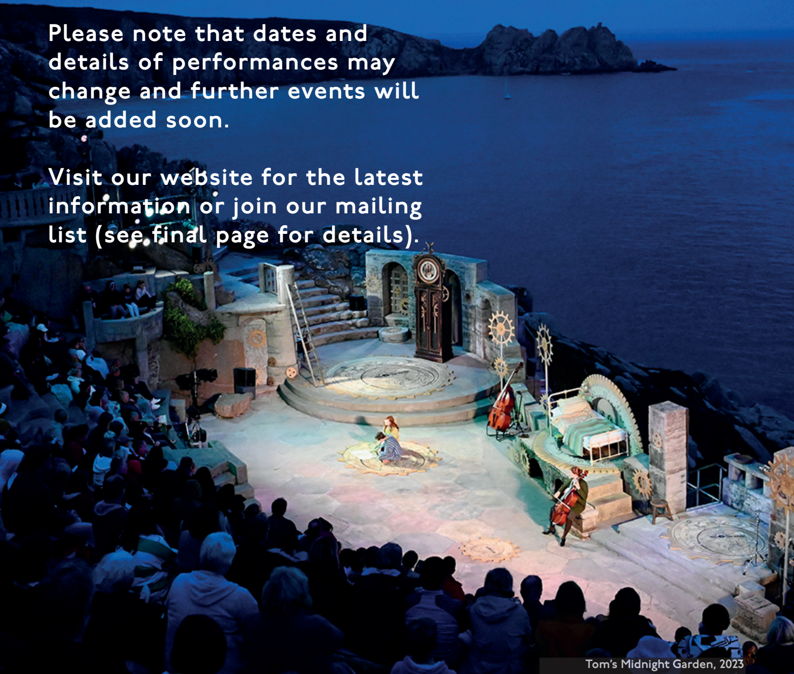
Tom's Midnight Garden, 2023

Visit our website for the latest information or join our mailing list (see final page for details).