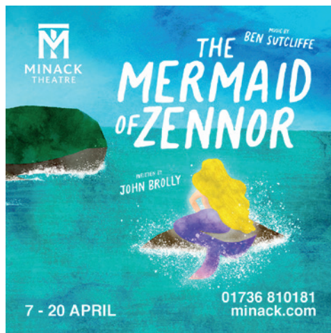
Image must be capable of working in different formats and with differing amounts of text overlay.